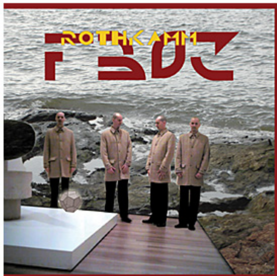
ROTHKAMM FB03 (E Pluribus Unum)

Reason is neither a bone nor an accident