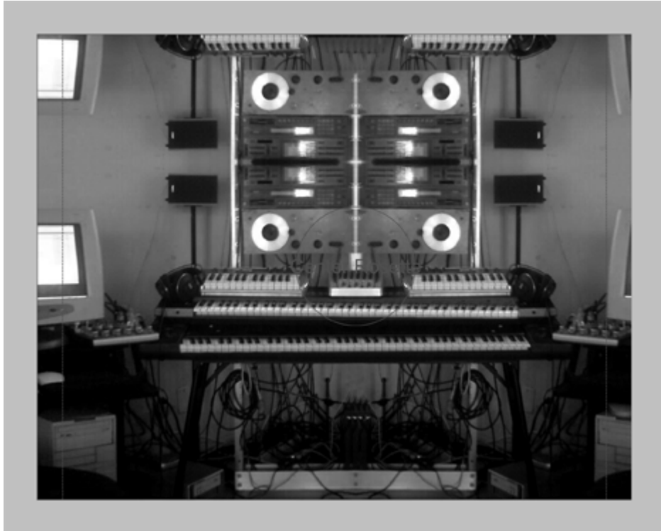
==The IFORMM data processing instrument system ==

The real answer is twofold: if there exists a perceptual or compositional reason a needed tuning system will be devised. if there exists a smallest distance between two frequencies, then a compositional or possibly perceptual effect will be produced.