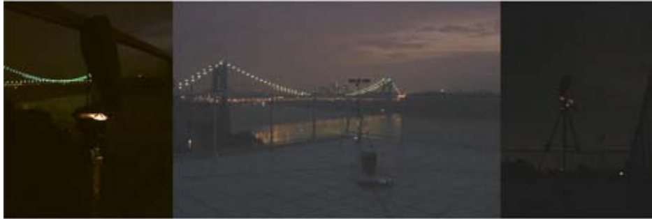
ROTHKAMM™ FB02 New York (June 29, 2006 9:04 PM EDT)

Subject: Discreet Mathematics of 768 Frequencies [FB02] New Work + Interview (Vol 1)