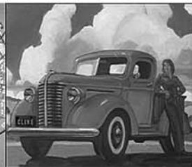
3 California Pink-A-Pades 7.00