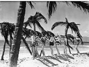
7 Encounter with Remarkable Trees 3.25