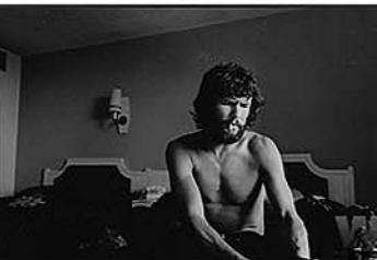
1 Kris Kristofferson of the Avant-Garde 3.31