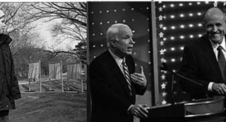
9 B and B plus 33 1.01