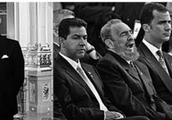
6 Sleepy Bullet 6.57