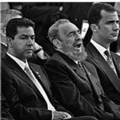
8 Younger Critics of New York 0.40