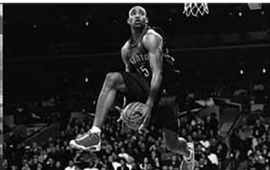
4 Half Man, Half Amazing 6.04