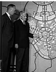
2 The Irvine Master Plan 1.43